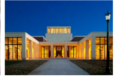
George W. Bush Presidential Library & Museum

2943 SMU Blvd., Dallas 75205 | 214.346.1650 GeorgeWBushLibrary.smu.edu