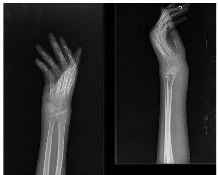
Figure 3. Radiograph of chronic extrapulmonary tuberculosis of the wrist in a 13-year-old boy confirmed with PCR testing.

The effects of chronic osteomyelitis are far-reaching. Beyond the pain and discomfort associated with pathologic fractures and chronic draining sinuses (Figure 5), many patients are also limited in their educational and vocational opportunities. Because many secondary schools are boarding schools in Kenya, a student may be refused admittance if they have a chronic draining sinus as it is a sanitary and hygiene concern.